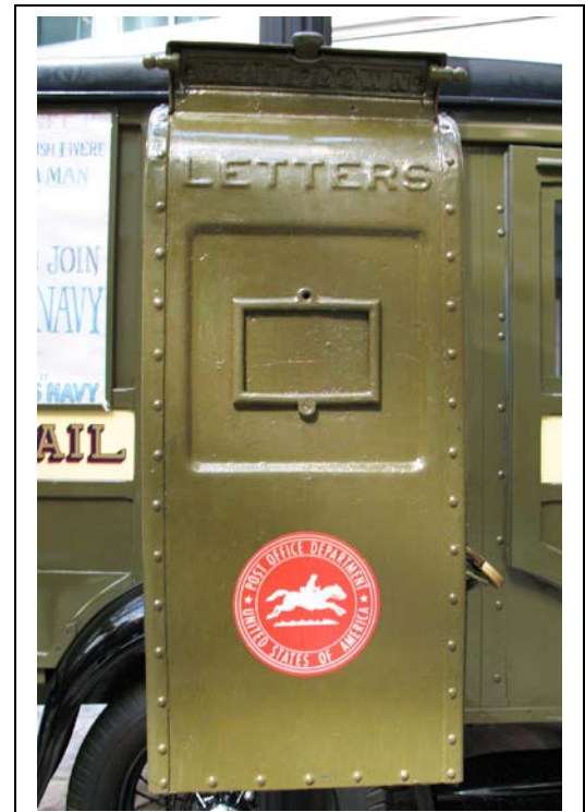
Owens Mailbox. Photo by Mr. TinDC. Some rights reserved https://creativecommons.org/licenses/by/

The National Map Corps asks for information on Public Attractions and Landmarks. Some of the information can be obtained through 'geocaching.com' . This is a GPS family treasure hunt game. Several sites at geocaching.com are in Kansas at Smith and Osborne counties 'Geodetic Center as Close as you can Get' (GC9064); 'Center of the United States' (GC10N63). Some local residents have hosted tours of the Geodetic Center in 2007-2010 (GC14DP9), (GC15XVW), (GC1X9QD), and (GC23MNA). Geocachers also have these geocaches in cemeteries.