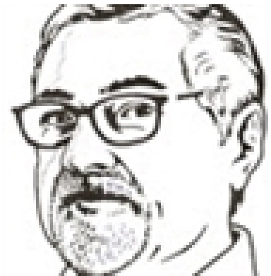
U.S. Geological Survey (USGS) Information Collection Clearance Officer

"PRA and Usability Testing" Presentation at CDI Usability Meeting April 15, 2020