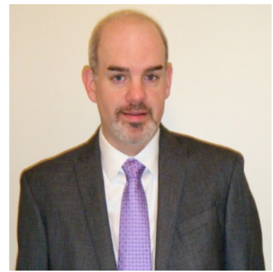
Department of Interior (DOI) Departmental Information Collection Clearance Officer