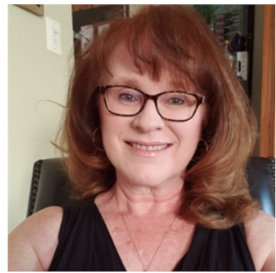
U.S. Fish and Wildlife Service (FWS) Information Collection Clearance Officer (DOI alternate)