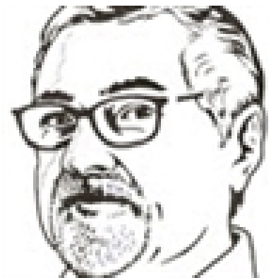
U.S. Geological Survey (USGS) Information Collection Clearance Officer

"PRA and Usability Testing" Presentation at CDI Usability Meeting April 15, 2020